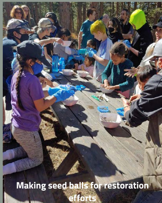
Making seed balls for restoration efforts